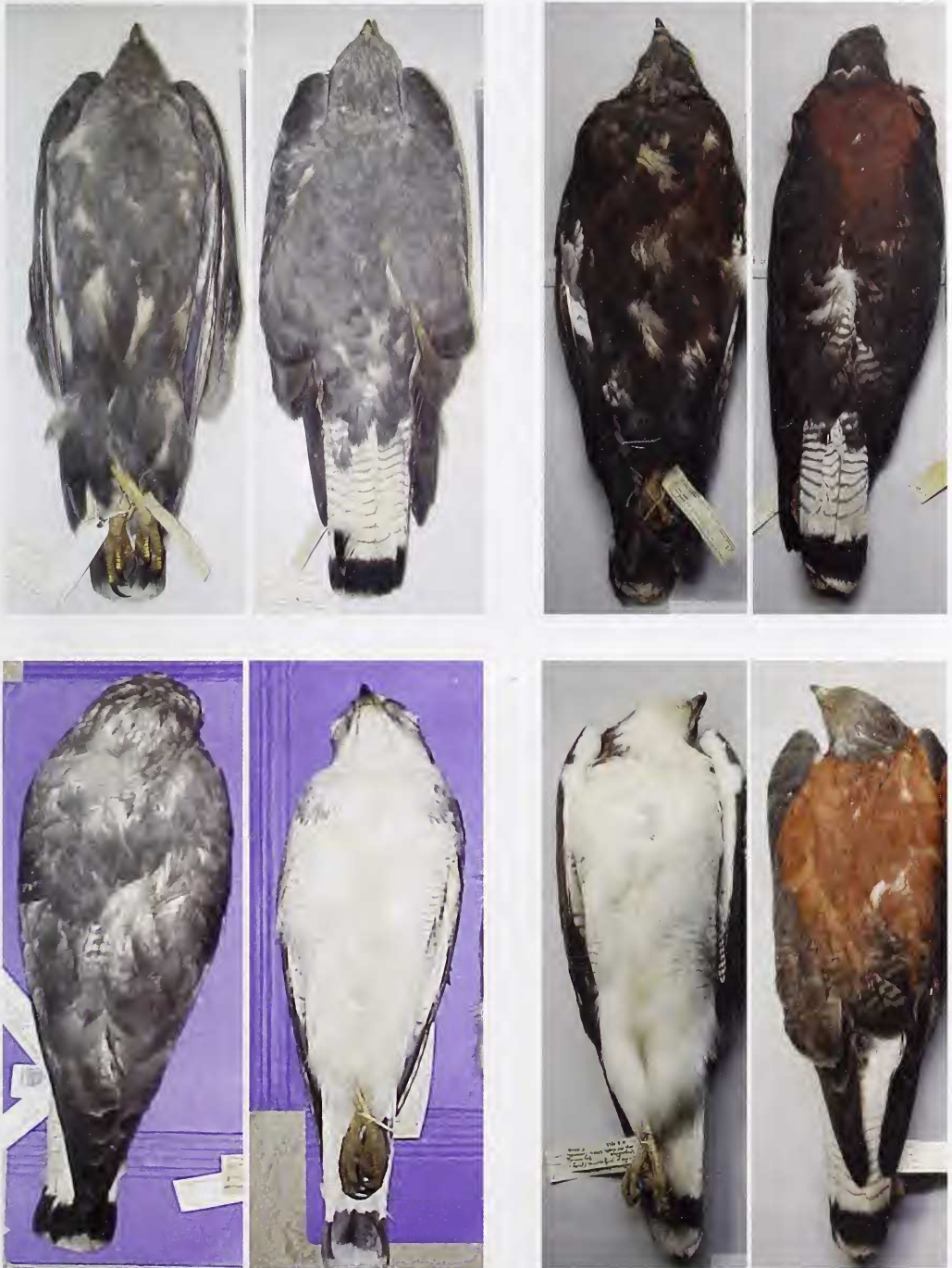
Figure 1. Upper images adult male (BMNH) and female (NHRM) Variable Hawks Buteo polyosoma in dark-morph plumage, ventral and dorsal views; below, adult and female pale-morph B. polyosoma held at ZMA and NHRM, respectively (J. Cabot)